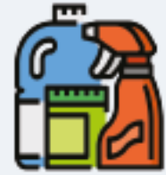
Non-durable household goods