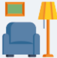
Furniture and furnishings