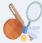
Recreational and sporting services