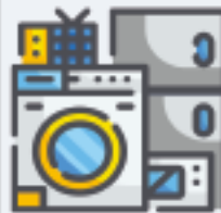
Repair of household appliances