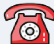
Telephone and telefax equipment