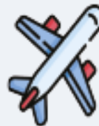
Passenger transport by air