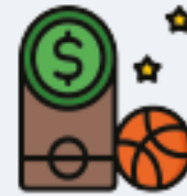
Games of chance