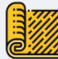
Carpets and other floor coverings