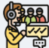
Telephone and telefax services