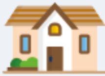
Actual and imputed rentals for housing