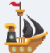
Passenger transport by sea and inland waterways