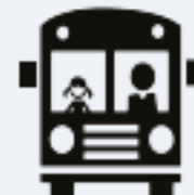
Passenger transport by road