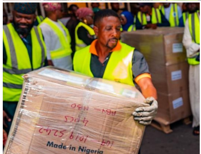
Launch of the Nigeria/East and Southern Africa Air Cargo Corridor