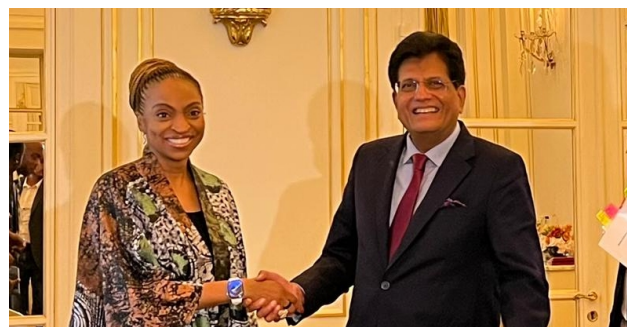
Meeting with Mr. Shri Piyush Goyal, Minister of Commerce and Industry, India on the sidelines of the Informal Meeting of WTO Ministers hosted by the Organisation for Economic Co-operation and Development