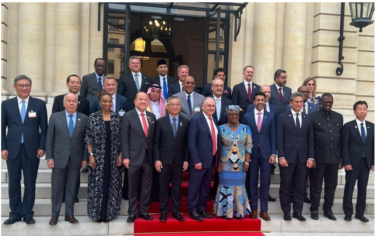
Informal Meeting of WTO Ministers hosted by the Organisation for Economic Co-operation and Development