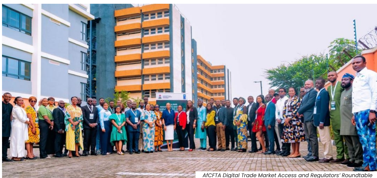
AfCFTA Digital Trade Market Access and Regulators' Roundtable