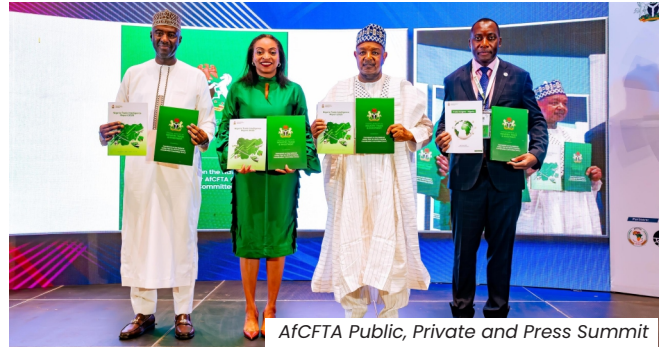
AfCFTA Public, Private and Press Summit

In November 2025, the AfCFTA CCC under the direction of the Honourable Minister of Industry, Trade and Investment convened the AfCFTA Public Sector, Private Sector and Press (P3) Summit to foster a common understanding of the AfCFTA Framework and the resultant implications and opportunities for Nigeria. The Summit kickstarted a nationwide AfCFTA Sensitisation and Consultation Campaign that will formulate a national blueprint to ensure the AfCFTA works for Nigeria.