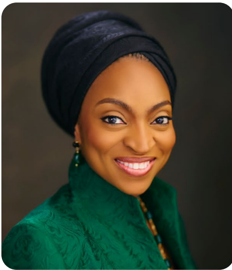
Dr. Jumoke Oduwole MFR Honourable Minister, Industry, Trade and Investment