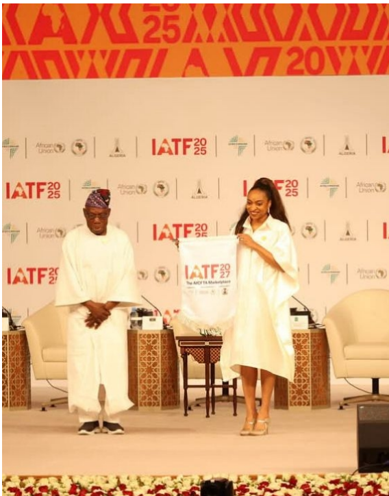
Nigeria winning the bid to host the Intra-African Trade Fair 2027

The Intra-African Trade Fair is Africa's largest marketplace, organised by the African Export-Import Bank, in collaboration with the African Union Commission, and the AfCFTA Secretariat. The Fair connects buyers, sellers, investors, and governments to unlock opportunities presented by the African Continental Free Trade Area. In September 2025, Nigeria successfully won the bid to host the Intra-African Trade Fair 2027 and the precursor Creative Africa Nexus 2026.